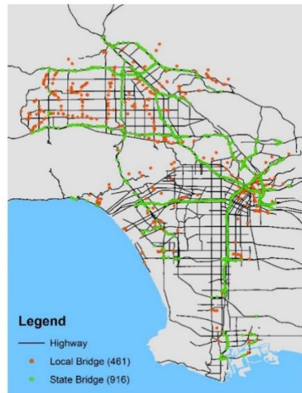
Figure 1. Los Angeles highway network showing all state and local bridges.