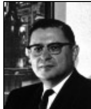
NATHAN M. NEWMARK

(1912-1999) Formerly Vice-Chancellor University of Roorkee India