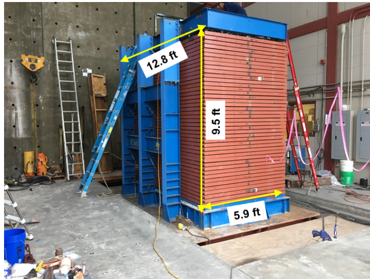
Figure 1: Laminar Soil Box at UCSD's Powell Laboratory