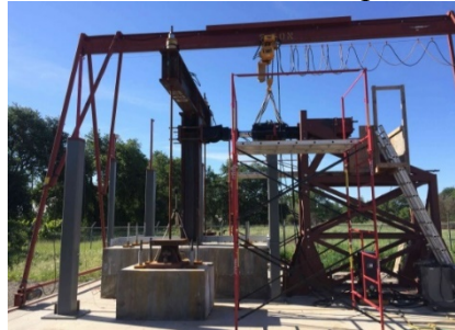
(b) Test setup for experimental component of the study